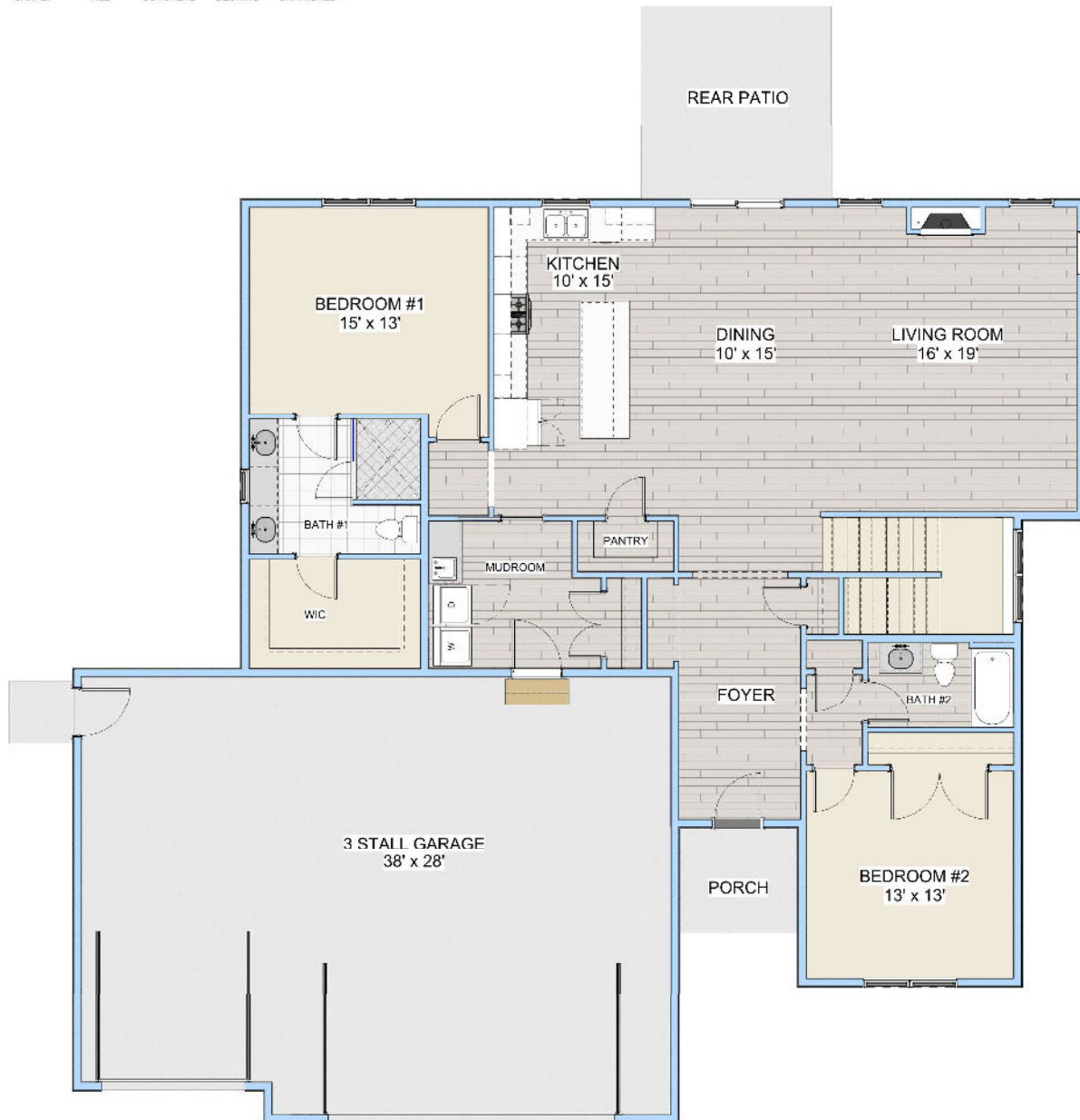
MAIN FLOOR LAYOUT